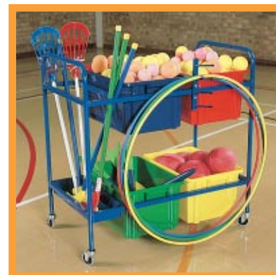
☒ Standard Equipment Trolley