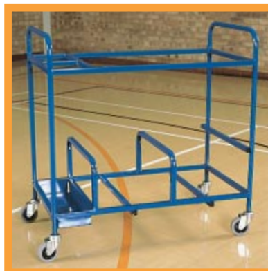
☒ Aerobic Equipment Trolley