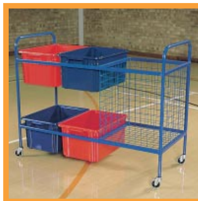
☒ Large Equipment Trolley