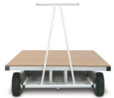
1.2m wide 2.2m long x 1.2m high