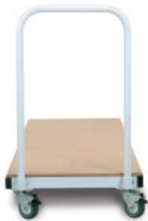
0.6m wide 2m long x 0.94m high