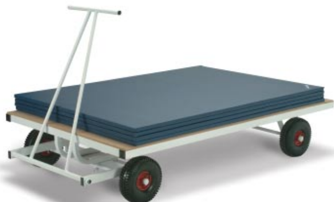
☒ Super Heavy Duty Trolley