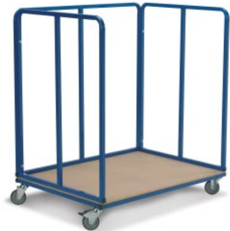
☑ Aerobics Trolley