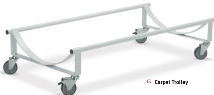
☑ Carpet Trolley