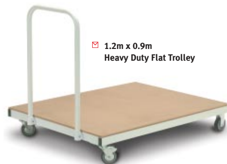
☒ 1.2m x 0.9m Heavy Duty Flat Trolley

Please check door width before ordering.