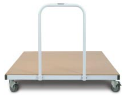
1.2m wide 2m long x 0.92m high