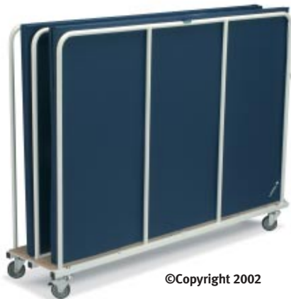
☑ Vertical Trolley