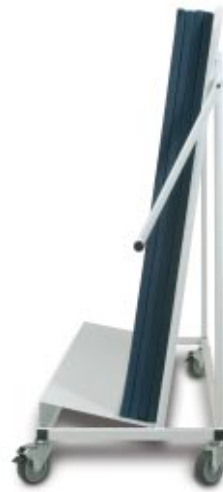
0.56m wide 2.1m long x 1.4m high