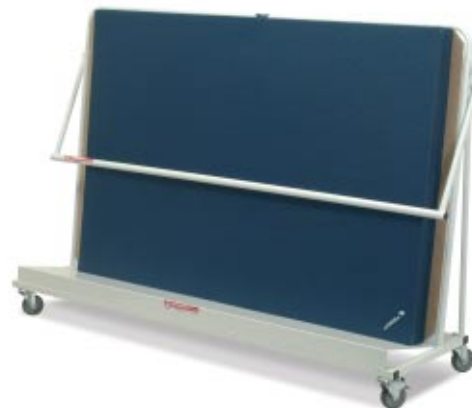
☑ Inclined Trolley