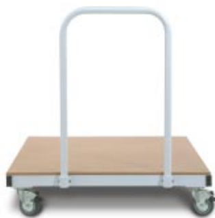
0.9m wide 1.2m long x 0.94m high