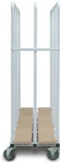
0.42m wide 1.93m long x 1.38m high