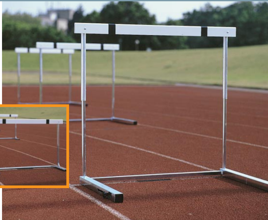
☒ H6 Fixed Leg Competition Hurdle