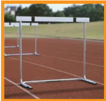
☒ H7 Schools Practice Hurdle

Competition and practice hurdles to suit all requirements. Each supplied complete with laths which can be screen printed on request.