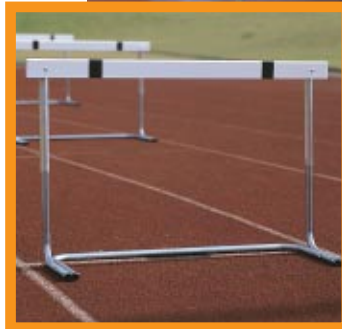
☒ H8 Junior Practice Hurdle